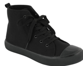
HIP HOP SHOES