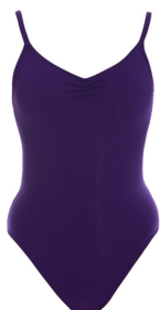
PURPLE LEOTARD & SKIRT