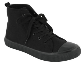
HIP HOP SHOES