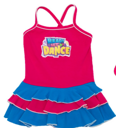
TUTU DRESS $46

All READY SET DANCE, READY SET BALLET and TINY TUMBLERS students will be required to wear the official uniform that we are sure you will love. Below are the following options that can be purchased at reception.