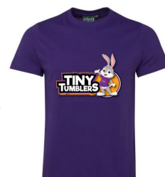
TINY TUMBLERS SHIRT $35