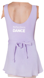
LILAC LEOTARD & SKIRT